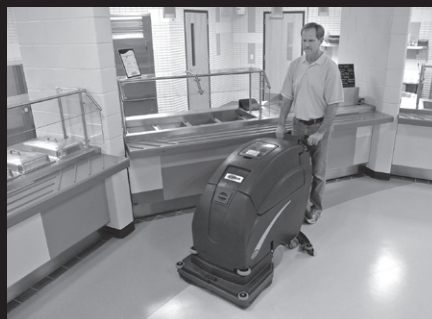
Engineered to withstand heavy, daily use in commercial applications such as schools, office buildings, and medical facilities.