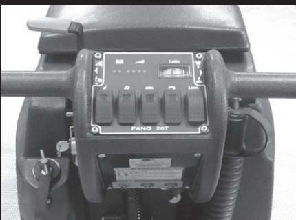
Easy-to-use, fingertip controls.